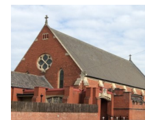
Ss. Mary & Benedict