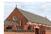
Ss. Mary & Benedict