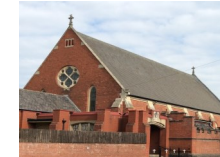
Ss. Mary & Benedict