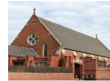
Ss. Mary & Benedict